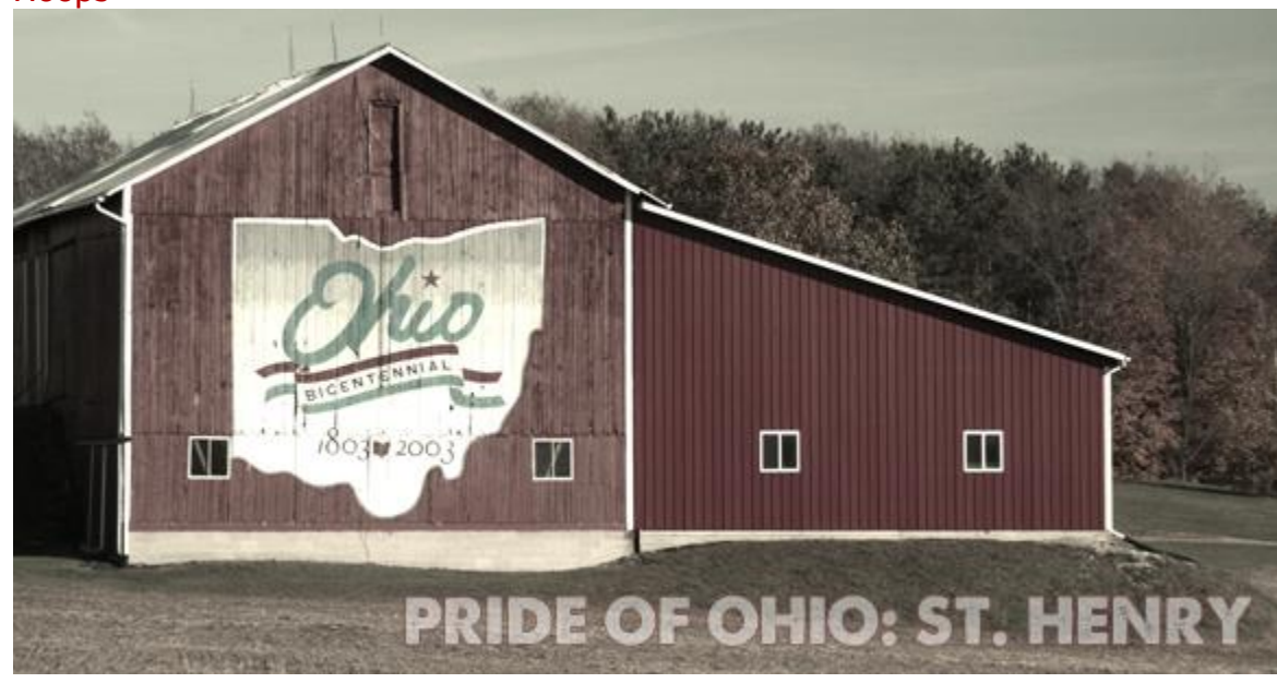
"Pride of Ohio" is an homage to the small to medium-sized Ohio cities that have helped to shape Ohio State athletics.

Two thousand four hundred twenty-eight. That number can apply to multiple things in St. Henry – the population and the number of townspeople filling the Wally Post Athletic Complex on a Friday night. The number one is also significant, as in the number of police officers and stoplights.